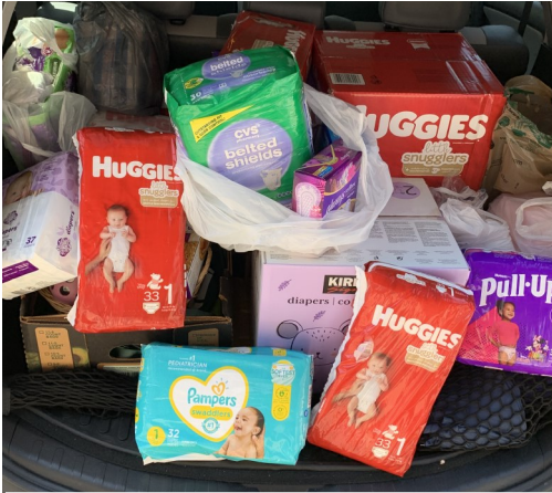
Becky House delivered a vehicle load of diapers to the Diaper Bank, donated by the UMW.

* Total plastic recycled for 2021: 2,313 lbs