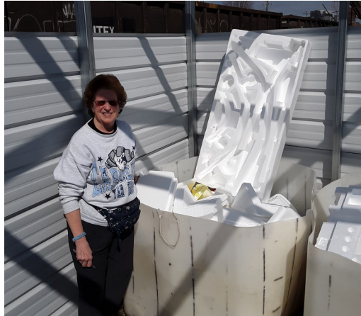
Sharon Stone delivered a vehicle load of styrofoam to the recycling center in Greensboro.

Thanks for your faithfulness in recycling plastic and Styrofoam!